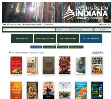
The general Evergreen Indiana Catalog will no longer include electronic holdings from Overdrive and Hoopla

In 2023, after a multi-year investigation into available products, support providers, and pricing structures, the Executive Committee voted to enter a five-year contract with Equinox Open Library Initiative for the implementation and support of Aspen Discovery. Aspen Discovery is a full-featured open-source discovery system providing comprehensive access to physical and digital library resources. The implementation of Aspen Discovery for all Evergreen Indiana member libraries means that, for the first time since the launch of the consortium, libraries will have a one-stop shop for all their resources and the ability to truly customize their patrons' search experience with browse categories, digital billboards, and locally relevant design.