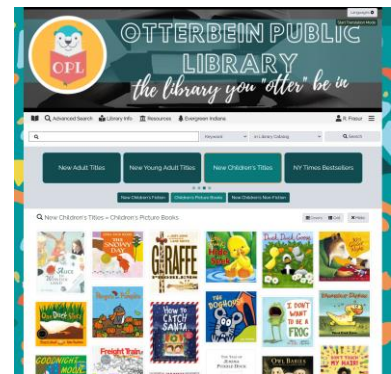
Otterbein Public Library designed to match library's website