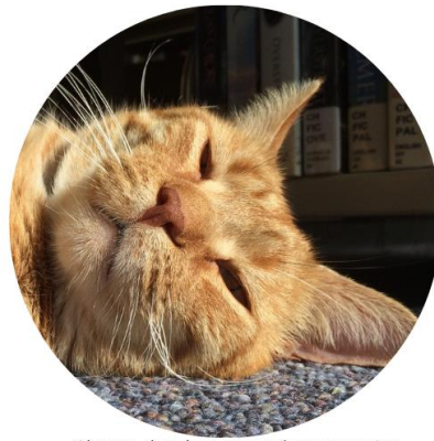
Chance, the Thorntown Library Boss Cat

The Basic Cataloging and Advanced Cataloging asynchronous courses were released in 2023.